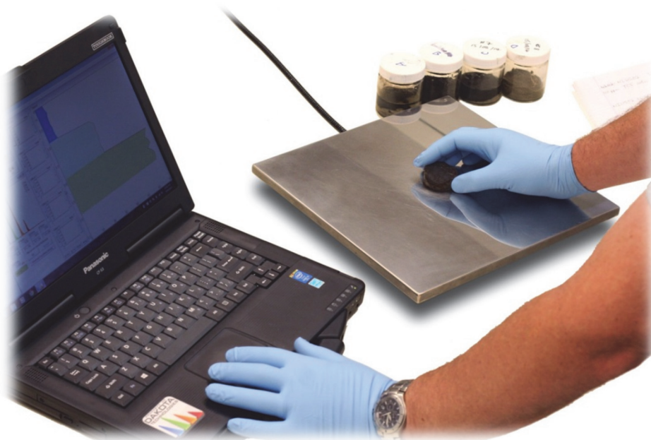
Figure 2. A core segment being analyzed on the LIF sample station

The frozen core segments are analyzed at Dakota’s facility on a LIF sample station built specifically for LIFFCA. Figure 2 shows the station being used to analyze a frozen core segment. The LIF analysis occurs in a small (ca 4mm 2 ) area at the front face of the sapphire window (not visible in Figure 2 because it is hidden under the core segment in the technician’s hand). The station’s optics match those of Dakota’s standard percussion and CPT probes, so the data is directly comparable to downhole LIF. The station’s polished and seamless design allows for complete decontamination between samples, eliminating any risk of NAPL carryover between core segments.